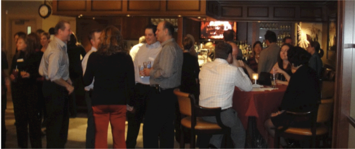
Settler's Grove Community Association residents enjoy conversation and refreshments at the 2012 holiday party. The party was attended by over 100 residents.