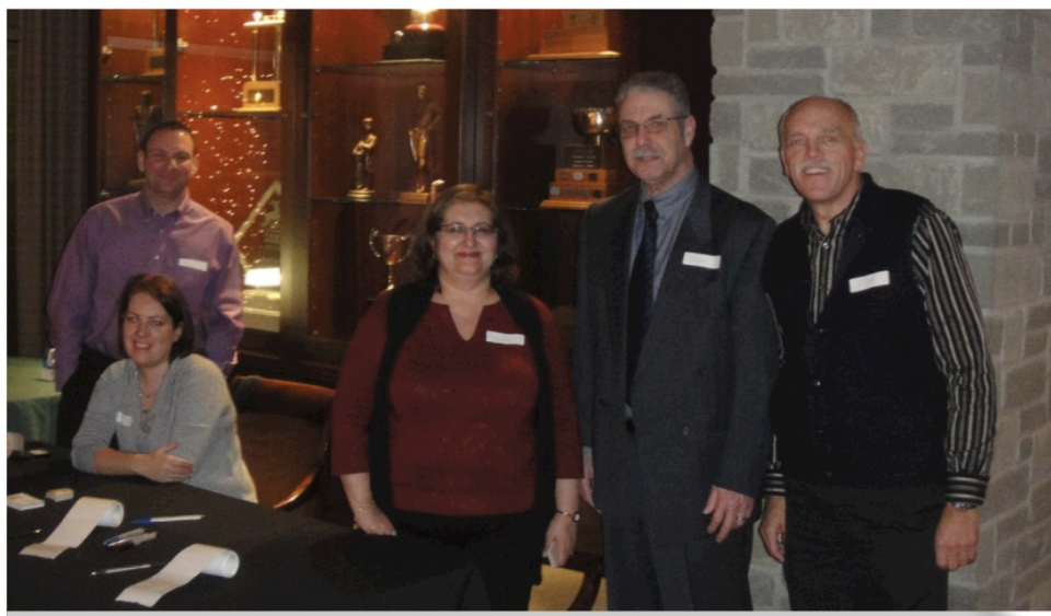
Settler's Grove Community Association Board and Social Committee Members welcome guests at the holiday party.

To learn more about the association and to get involved, please attend the 2013 General Meeting on Wednesday May 15 th at the Sportsworld Crossing Twin Pads Community Room at 7pm. We hope to see you there!